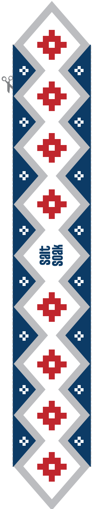
Salt Soak · 8 oz · Bail Jar · Side Label