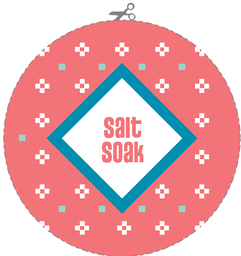
Salt Soak · 8 oz Bail Jar · Top Label