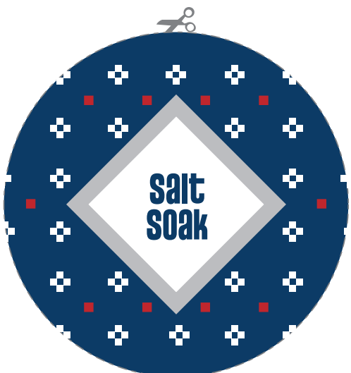
Salt Soak · 8 oz Bail Jar · Top Label